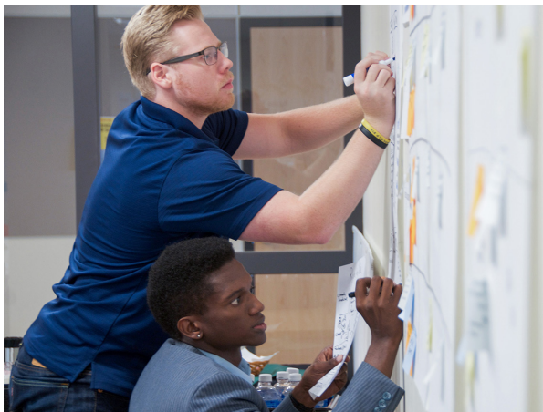
Twenty participants received the Master of Science in Business Design and Innovation degree in May.