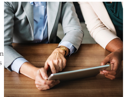
WAICU offers over 40 collaborative cost-savings programs to its members.

Through the WAICU Retirement Readiness Plan, WAICU offers its members a solution that can reduce costs and create administrative efficiencies. These savings and resources, in turn, reduce the costs that are passed along to students and advance WAICU's mission of “working together for educational opportunity.” ■